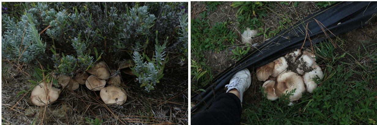
Figures 8 and 9. The left image is of field mushrooms under the lavender plant. The right image is of field mushrooms under landscape fabric.