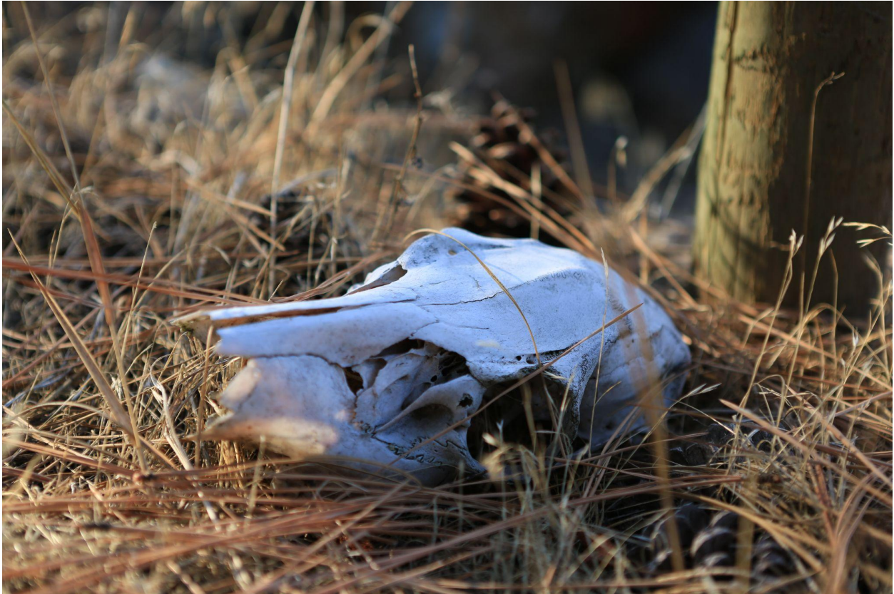
Figure 6. A deer skull found near the bottom of our lavender field.