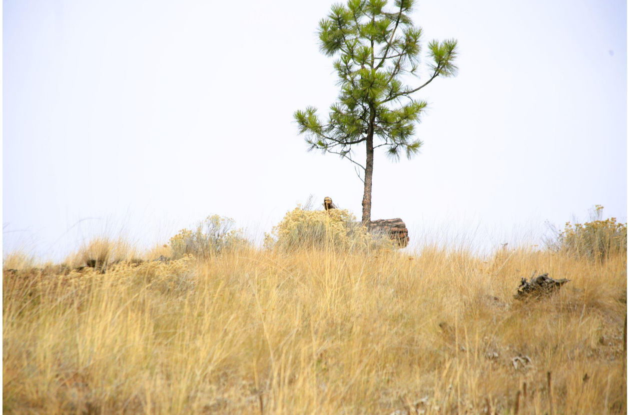
Figure 5. Grasslands near the upper portion of the lavender field that have not been landscaped.

Properties in WUI's are typically distinguished by the presence of grass, shrub and tree cover (Figure 5). This description accurately summarizes the landscape of our farm, where tall grass grows rampant and trees fence the property.