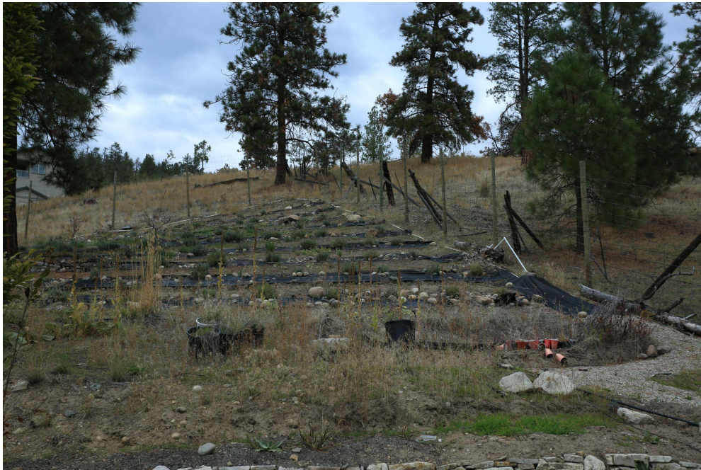
Upper Portion of the lavender field. October 2023.