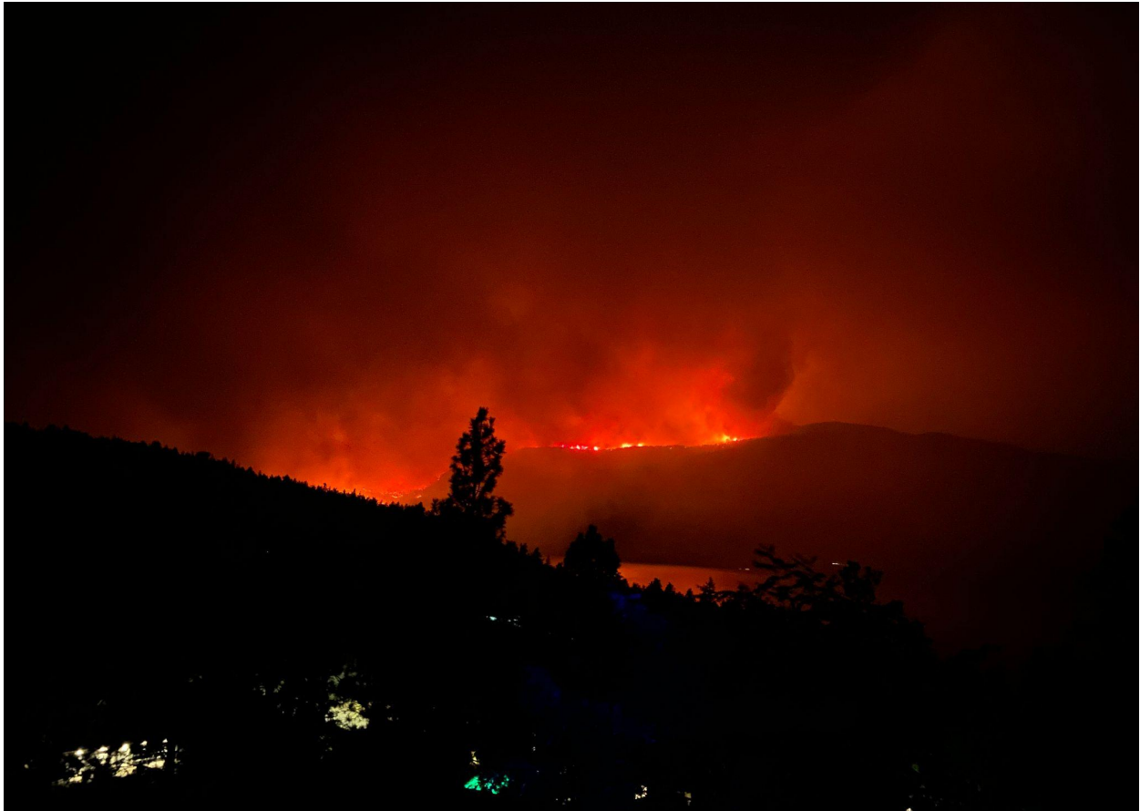
Figure 1. A view of the McDougall Creek Wildfire taken from the roof of my family's home in McKinley. August 2023.