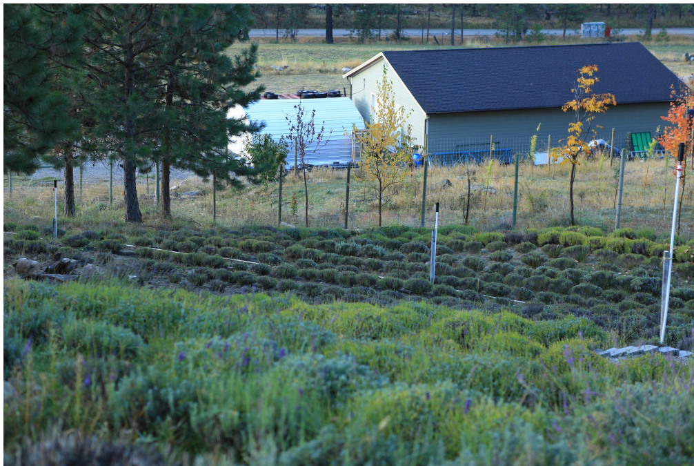
Lower Portion of the lavender field. October 2023.