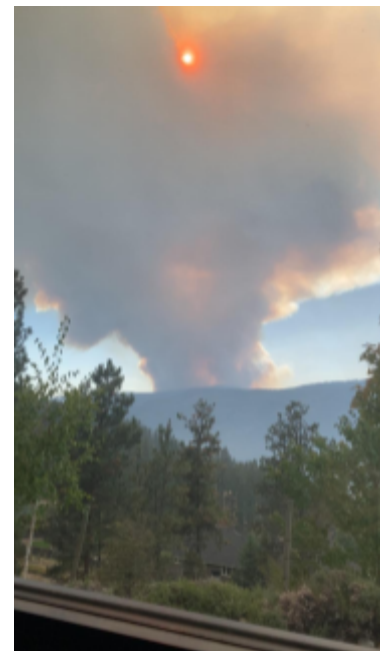
Figure 2. Smoke billowing as a result of the McDougall Creek Wildfire.

As we sat there on the roof, faces adorned with respirators, while sand-dollar-sized chunks of ash stormed toward our bodies, we came to an unspoken agreement: this fire was going to be different.