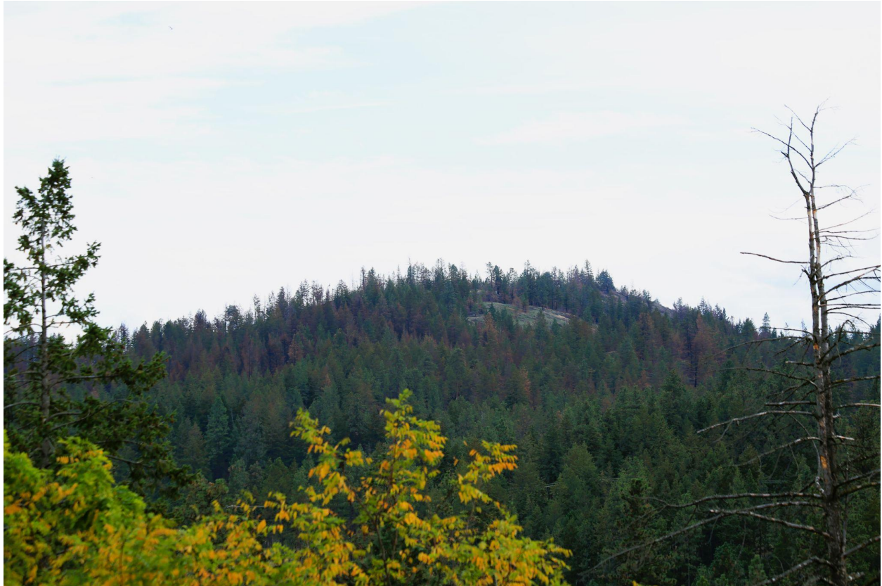
Figure 13. View of the burnt trees on the peak of Coyote Ridge.

on our sloping terrain. While observing these details I could not ignore the ever-present hum-drum of cars going up and down McKinley Road—a busyness that was particularly obvious in the afternoon.