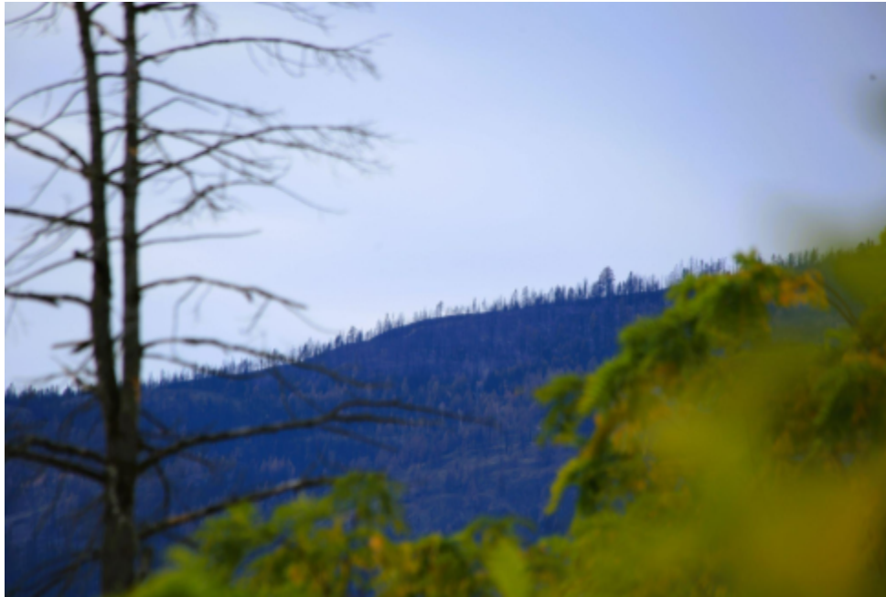
Figure 14. Charcoal trees from across the lake.

surrounding water bodies. One of which happens to be the McKinley Reservoir; where many residents get their drinking water. In addition to fire retardant, make-shift access roads were carved in several locations, tearing up the natural environment. From our property, the view across the lake spotlights charcoal trees and an absence of homes (Figure 14). Under my feet, I notice the palm-sized chunks of ash littered across the ground, a silent reminder of the chaos that ensued only a few months ago.