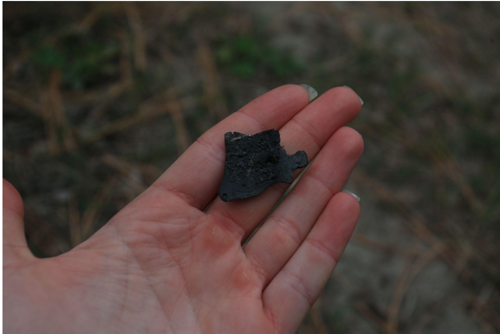
Chunk of ash found in the lavender field. October 2023.