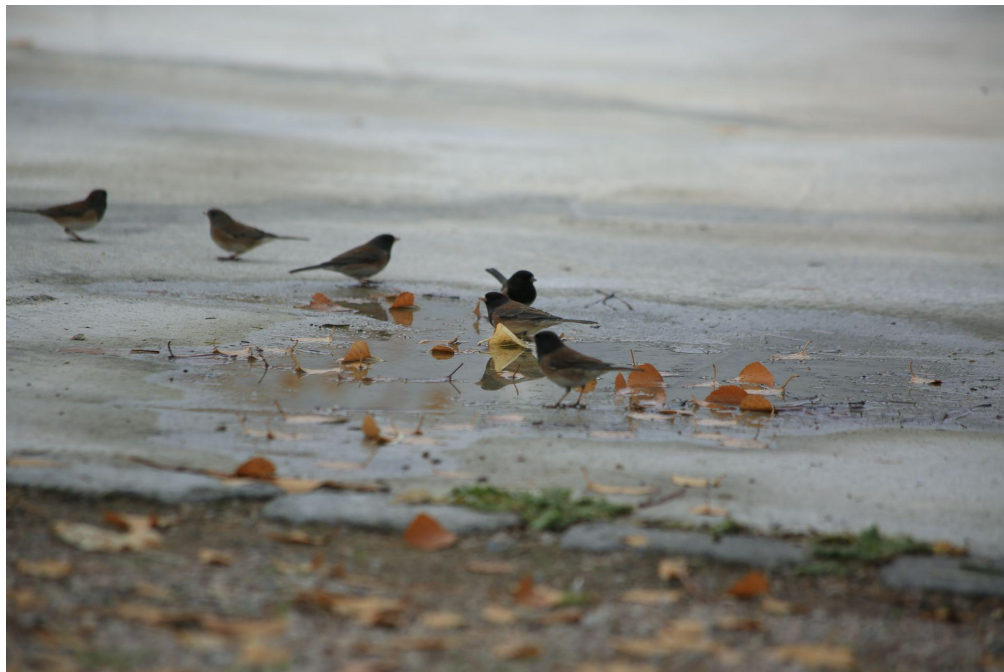
Birds found playing in a puddle. October 2023.