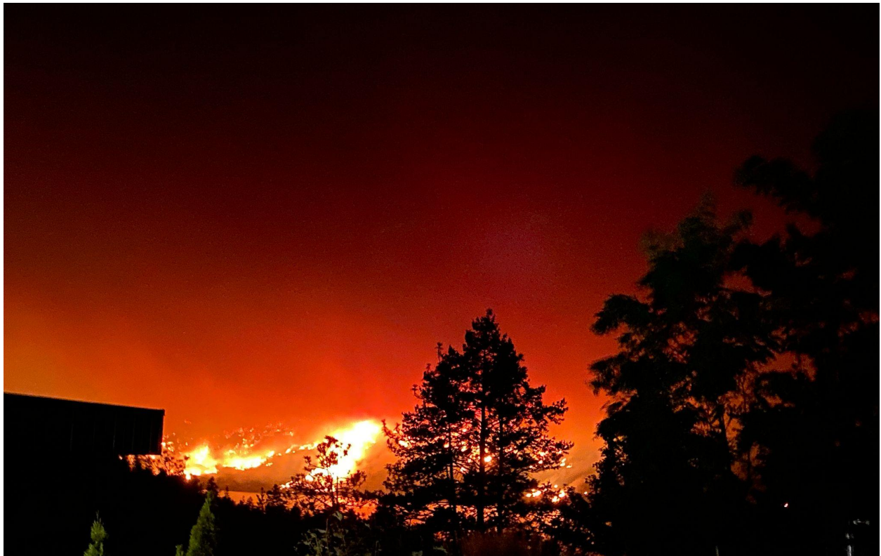
Figure 3. A view of the McDougall Creek Wildfire taken from the driveway of my family's home as we evacuated. August 2023.

After jamming our pets and what we thought were our essential items into our vehicle, we left our home with an uncertain goodbye (Figure 3).