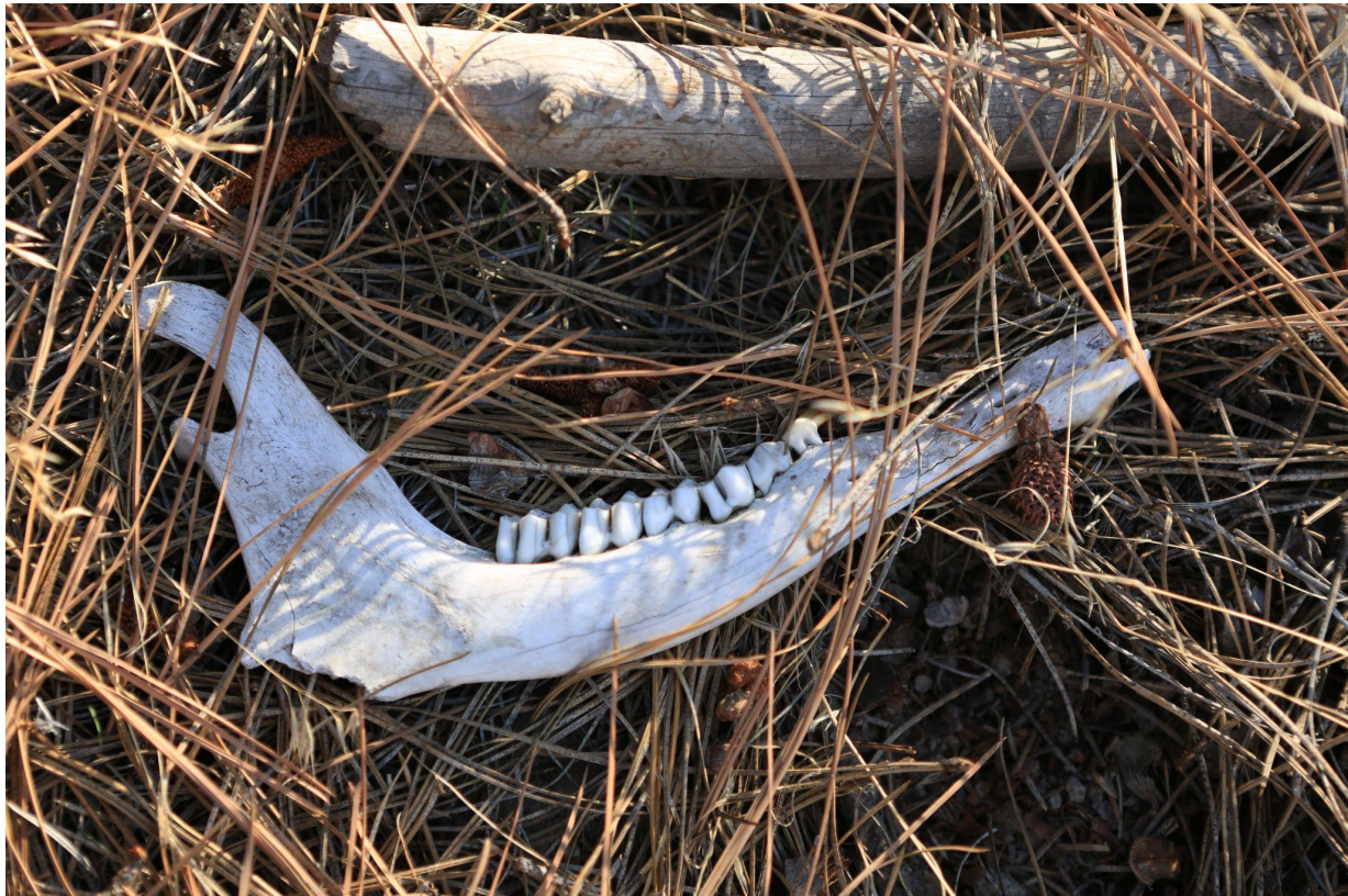
Figure 7. The jaw and teeth of a deer that were found near the bottom of our lavender field.