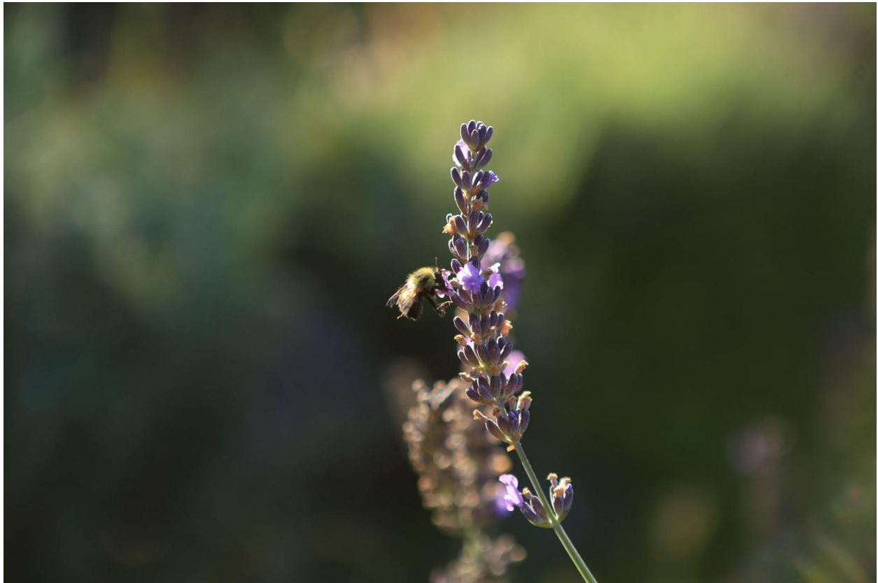
Figure 12. Bee hard at work pollinating the lavender that is left in our field.

bees still hard at work in the lavender blooms that remained. The relationship between our lavender and the work of the bees is symbiotic. Their labour translates into bountiful harvests on our end, and, for them, something akin to an all-you-can-eat buffet.