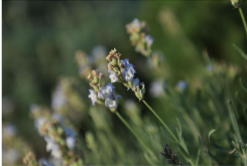
Figure 11. Remnants of the white lavender on our farm.

Given the significance of lavender to this study, it would be unusual to conclude without mentioning the lavender plants that occupy the majority of our land. My family grows six different species of lavender plants across our two-acre property for a total of almost 5,000 individual plants (Figure 10). In different sections of the field, one can observe the tall, grass-like stems of the French lavender, the short stubby stalks of the English, and the